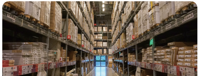
Manufacturing | Assets/Wareshousing/Tools