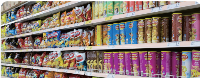
Retail | Retail/Store Management/Warehouse Management