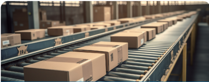
Logistics | Eco-friendly bags/warehousing/points