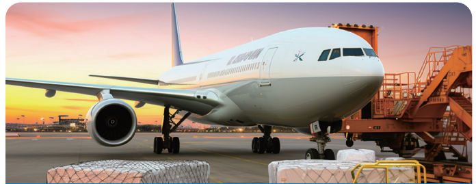
Public Utilities | Aviation/Medical/Finance/Electricity